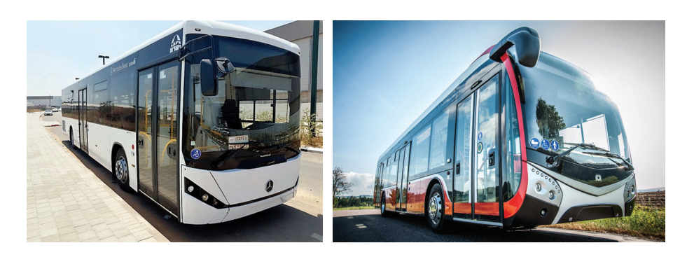
Figure 1 Diesel Bus MERCEDES - BENZ, Merkavim Pioneer and electric bus SOR-NS-12-electric

LCC = acquisition cost + operating cost × RBF + (residual price × \frac{1}{(1+r)^{p}} ) (10)